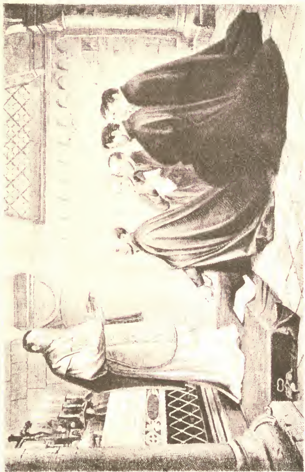
THE FIRST VOWS AT MONTMARTRE